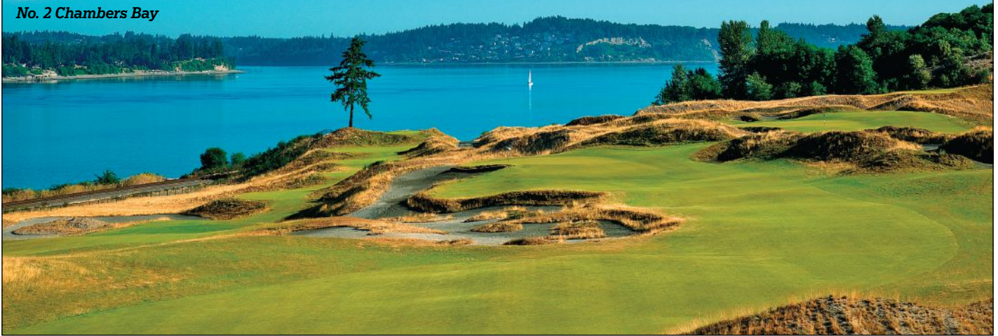
No. 2 Chambers Bay

KINGPINS BETHPAGE BLACK AND CHAMBERS BAY ANCHOR AN OTHERWISE SHUFFLED LINEUP