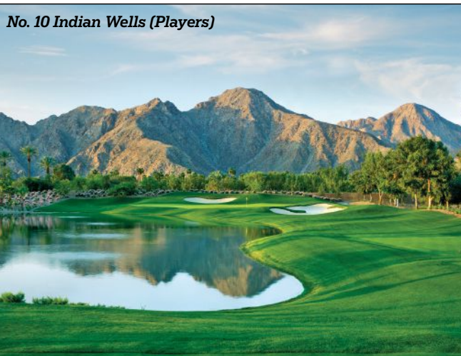
No. 10 Indian Wells (Players)

Chicago's Harborside International (Starboard) was the biggest gainer, jumping 21 spots to No. 25 from No. 46 a year ago. Pacific Grove, which occupies the same coastline as Pebble Beach, fared almost as well, rising 15 spots to No. 22. Others that strongly improved their standing this year were: